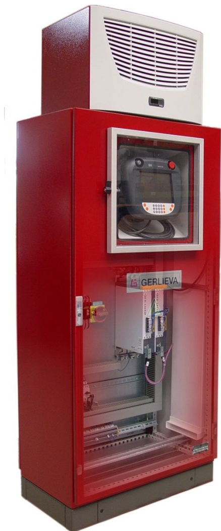
GERLIEVA control cabinet ACOPOS motion control roof-mounted cooling unit

interface to all standard die casting machines